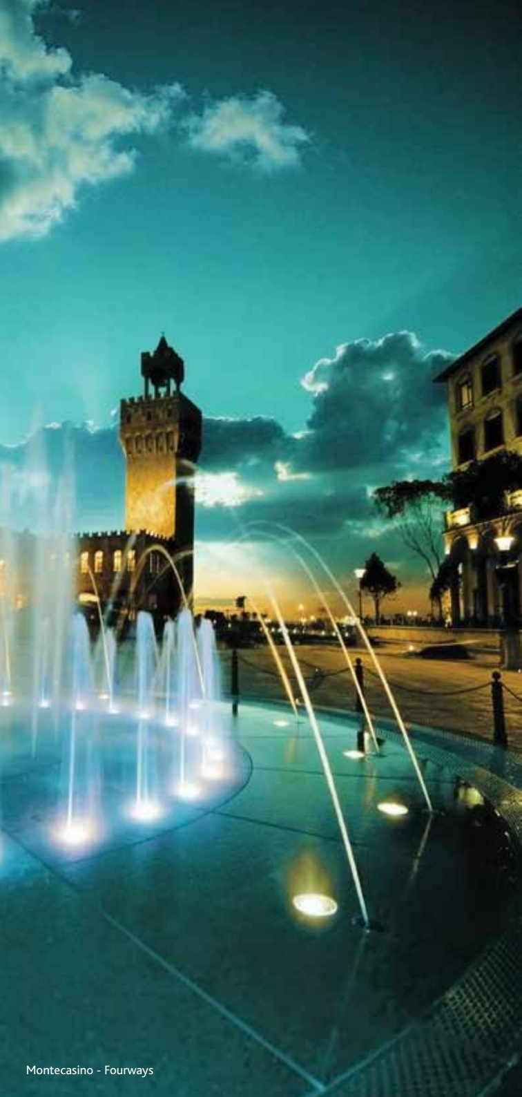
Montecasino - Fourways